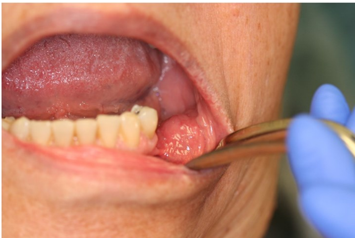
Figure 2. Intraoral photograph of mass in left buccal mucosa of cheek. Note the normal pink color overlying the mass.