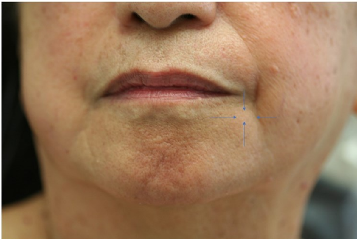
Figure 1. Clinical photograph of subtle mass on left cheek (arrows) that appeared to be a dermoid cyst.