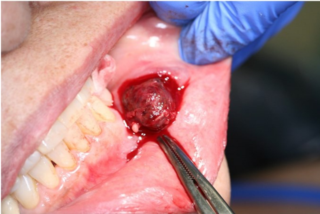
Figure 3. Intraoperative photograph of dissection of hemangioma from left cheek.